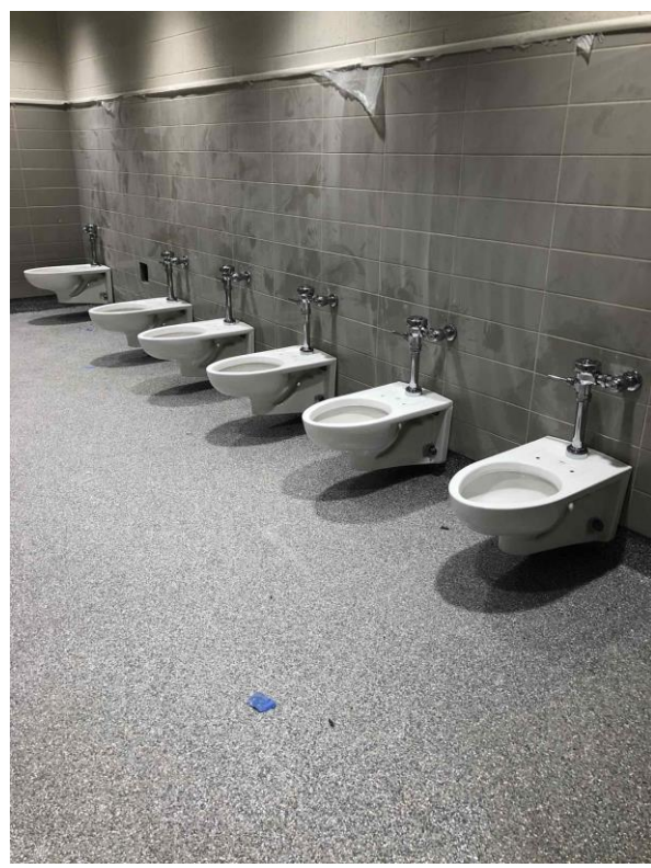
New gym Plumbing fixture installation